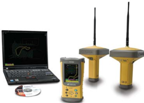
The primary components of our Grade Management System are two GR-3 GNSS receivers and an FC-100 field controller loaded with Pocket 3D Construction software.

With Pocket 3D, contractors can measure their productivity on a monthly, weekly or even daily basis to make sure they are staying on schedule. This information provides contractors a tool for maximizing equipment utilization. What a great way to get the most out of your biggest investment.