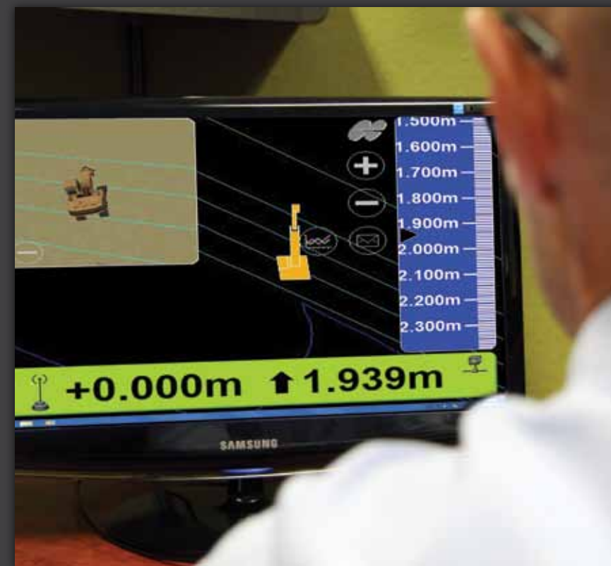
Service technicians can change settings, update firmware and train operators in real-time and from anywhere